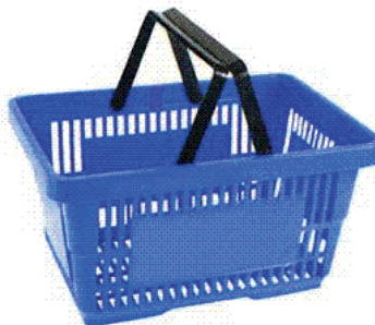
Two handles basket