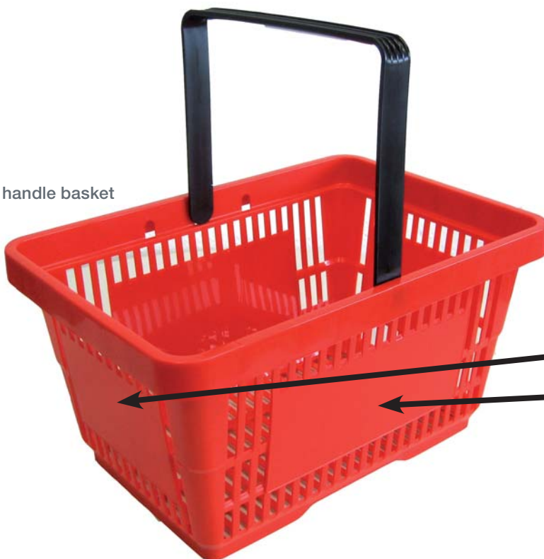
One handle basket