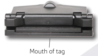
Mouth of tag